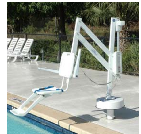
Splash Lift (STD)