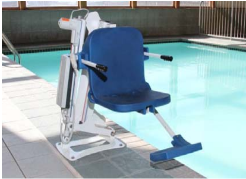
The Ranger Lift